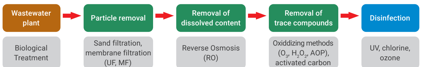
Fig.2: Schematic structure of the multi-barrier concept