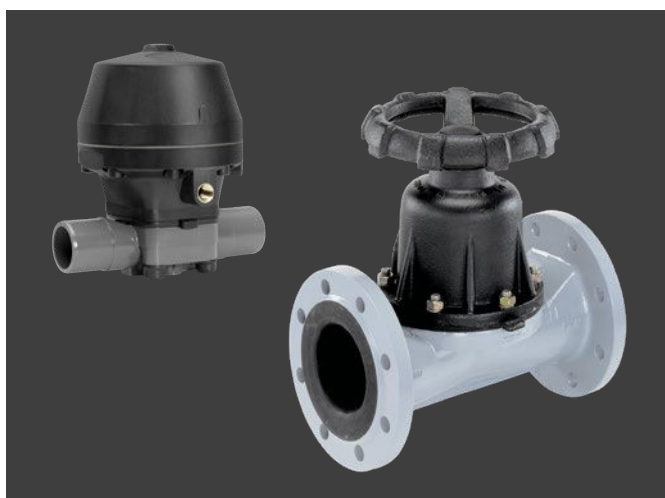
Fig. 4: Diaphragm valves in plastic or as full-bore variant are suitable especially for aggressive or particle-containing media

Diaphragm valves are particularly useful in applications where reliable flow control is required. They are also well suited for handling corrosive or abrasive liquids. This is important in the treatment of highly aggressive wastewater.