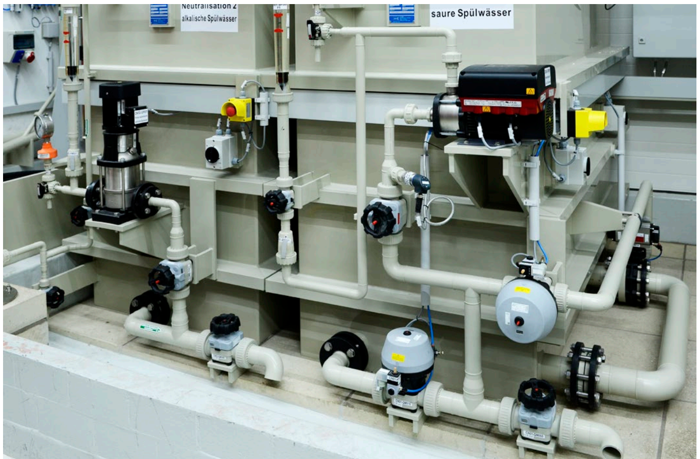
Fig. 1: Industrial wastewater treatment will become more important in the future, as shown here in a neutralization plant for wastewater in surface coating

The acceptance of water reuse among the population and industrial companies is another important factor. Awareness campaigns and transparent communication about the benefits and safety measures of water treatment can help to reduce reservations and increase acceptance. Organizations such as the IDRA (International Desalination and Reuse Association) or the IWA (International Water Association) support this through their work.