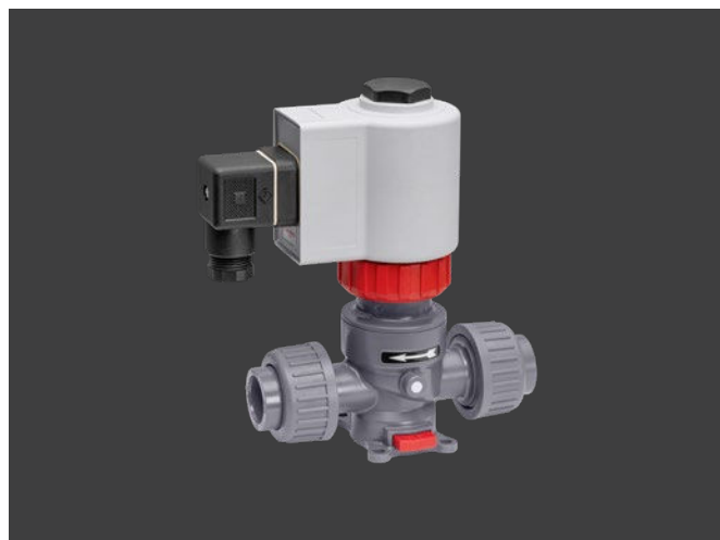
Fig. 6: Solenoid valves are suitable for adding chemicals

Solenoid valves are often used for small flows in on/off control, such as when adding chemicals.