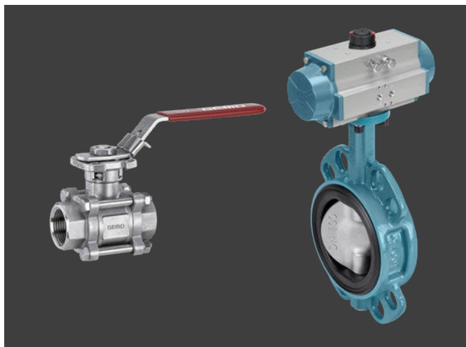
Fig. 3: Ball valves and butterfly valves are used in different variants

Ball valves or butterfly valves are widely used due to their simple design and reliability. They offer fast on/off control and are ideal for applications where full flow or shut-off is required. They are robust and can be found in all areas of water treatment.